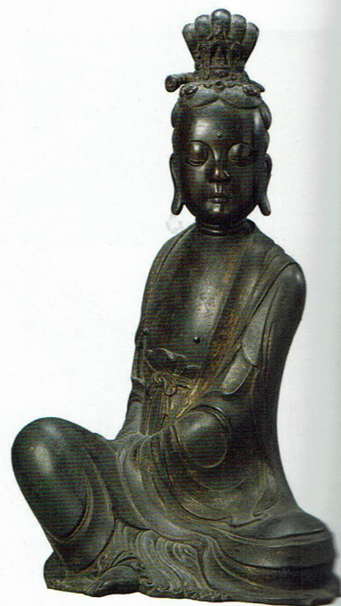
3. Seated figure of Guanyin, Ming dynasty (1368–1644), bronze, ht 42cm. Priestley & Ferraro at Fine Art Asia

As September closes, attention turns to Fine Art Asia , which returns to the Hong Kong Convention and Exhibition Centre (30 September–3 October). Now in its 12th year, the fair is dedicated to showing fine art and antiques from East and West with some 100 dealers offering everything from Hindu paintings and antique timepieces to contemporary art. As always, there's an impressive selection of antiques, led by London- and Hong Kong-based Rossi & Rossi, which brings an excellently preserved Mongolian gilt-copper sculpture of Chagan Sambhar-a dated to the late 17th or early 18th century. Other highlights include a 7th-century Ziwiye fragment from a famous gold belt with embossed animals originating in Central Asia, courtesy of David Aaron; a Ming dynasty bronze seated figure of Guanyin at Priestley & Ferraro (Fig. 3); and a selection of classical Indian paintings at the stand of new exhibitor Carlton Rochell Asian Art. Elsewhere, Gladwell & Patterson presents two works by Monet, including one of his early paintings made in the south of France, Près de Monte Carlo (1883), and the striking Portrait of Georges Fournier by Jean-François Millet, founder of the Barbizon school. Rare works by Japanese artist Inoue Yuichi, a master of ink painting, can be found at Kyoto-based Shibunkaku, and Runjeet Singh brings a group of exceptional Korean and Chinese eating knives from the 18th and 19th centuries. A